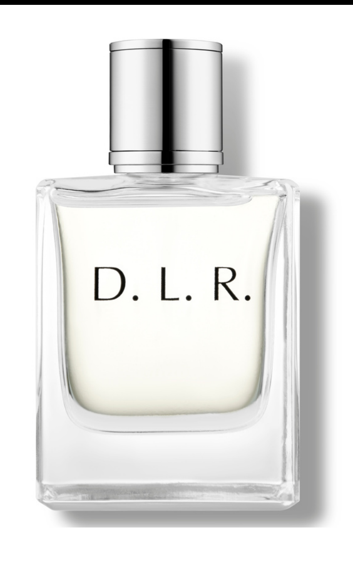
PALO SANTO, TONKA BEAN, CALABRIAN BERGAMOT, VETIVER, OAK