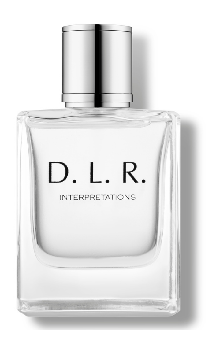
SANDALWOOD, CALABRIAN BERGAMOT, PALO SANTO, CEDAR, PEPPERCORN, PEPPERMINT