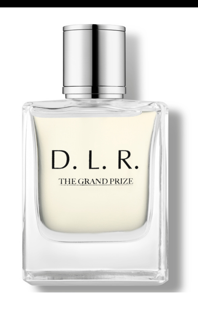
SANDALWOOD, CALABRIAN BERGAMOT, PEPPERCORN, PATCHOULI